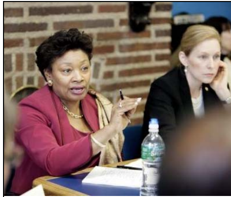
State Senator Andrea Stewart-Cousins and U.S. Senator Kirsten Gillibrand at the Yonkers YMCA roundtable discussion on gun and gang violence prevention initiatives

Last April, Senator Andrea Stewart-Cousins announced funding she secured from the New York State Senate initiative, "Operation SNUG," establishing a front-line anti-gun and gang violence prevention effort in the communities hit hardest across the State. The $4 million program will allow groups to create innovative programs that steer at-risk New Yorkers away from the culture of gangs and illegal drugs. As a result, Senator Andrea Stewart-Cousins secured $250,000 of funding for community outreach groups in the City of Yonkers for the resources necessary to keep our children safe and our streets secure.